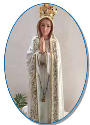
Invite Mary to your home and make it a special week for your family.

The only requirement is that you say the Rosary every day. The statue travels to different locations to inspire families to prayer together and invite others to pray with you!