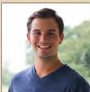
Catholic Evangelist Brad Pierron